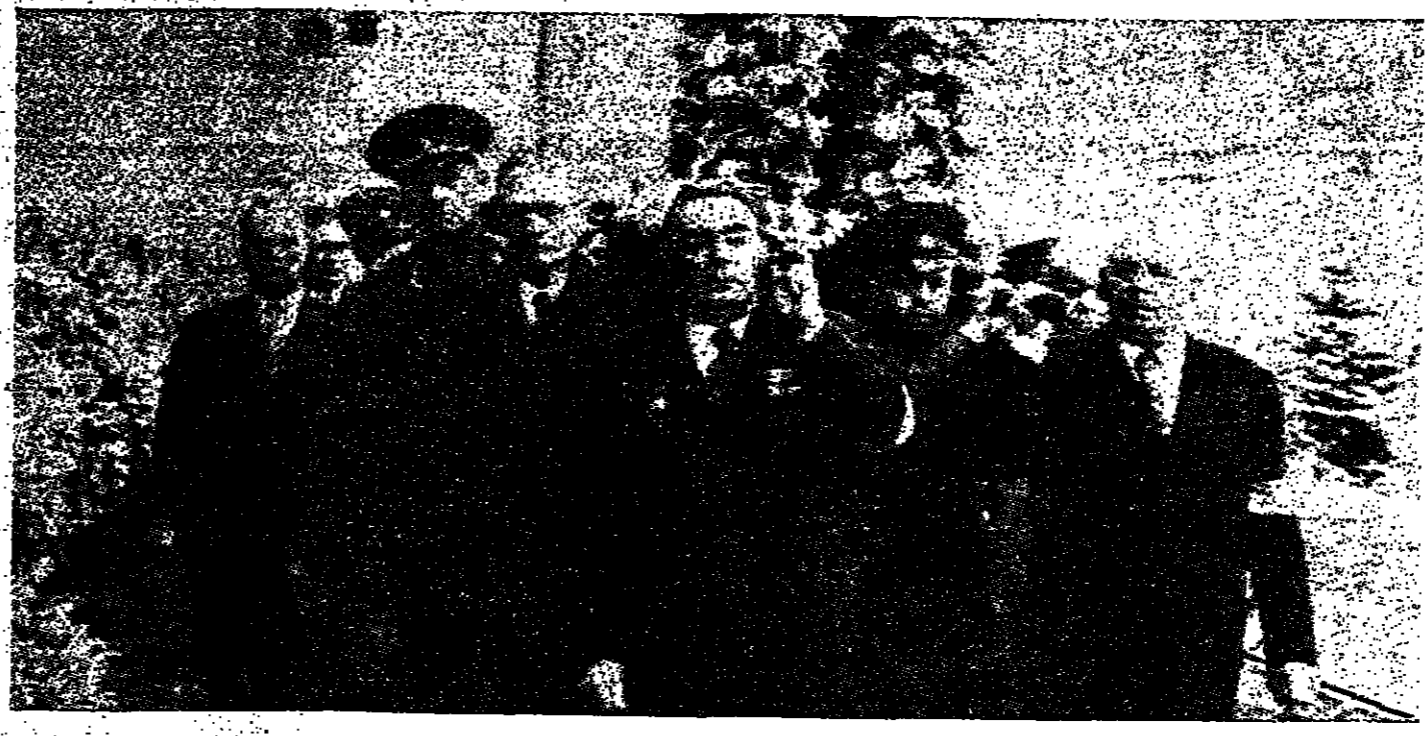
Farewell to a hero: (right to left) President Podgorny, Mr Leonid Brezhnev, the Soviet party leader, Mr Mikhail Suslov, a Politburo member, and Marshal Grechko, the Defence Minister...